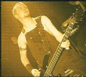
Michael McKeegan / Therapy?