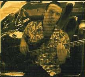
Nick Seymour / Crowded House