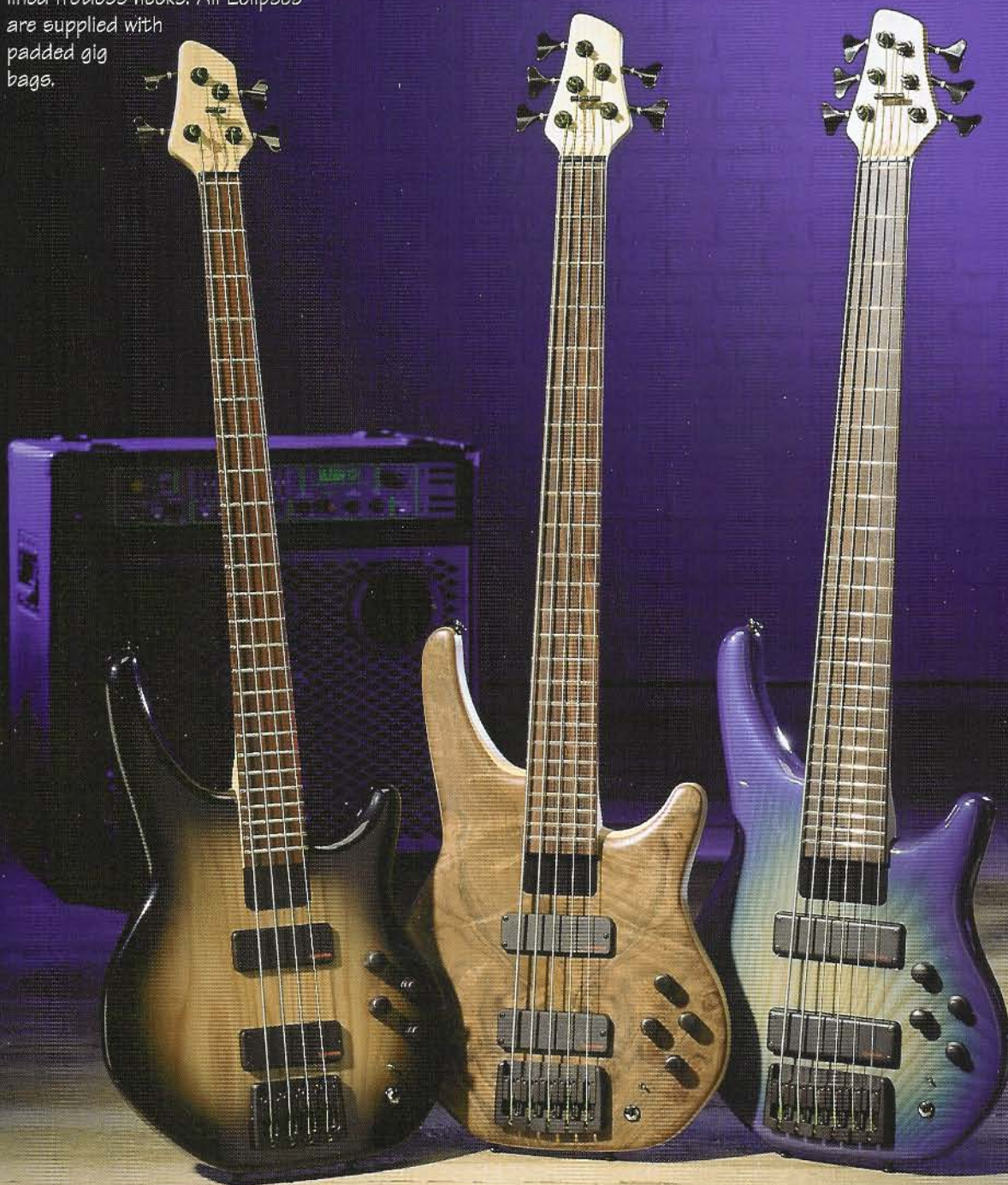
Eclipse 4 string in black sunburst Eclipse Artist 5 string in bookmatched walnut Eclipse 6 string in blue sunburst

The Eclipse Artist is a custom version of the standard Eclipse. Identical in specification, the body of the Eclipse Artist is also constructed from American ash, but features a bookmatched arched front in either maple or walnut, both finished in satin lacquer.