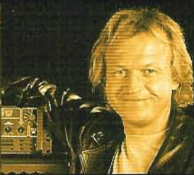
Mark King / Level 42