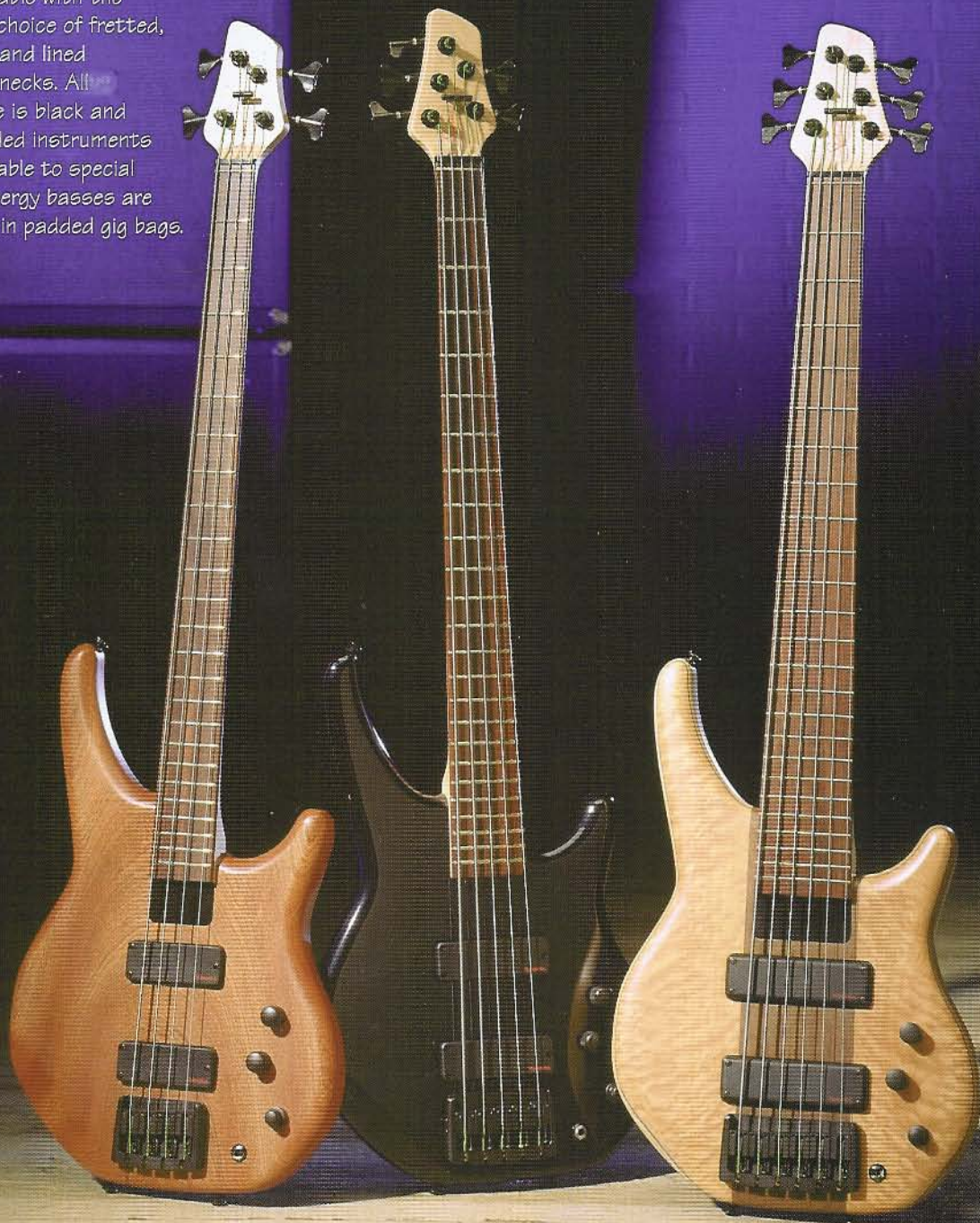
Energy 4 string in satin lacquered utile

Identical to the standard Energy in specification, the Energy Artists feature superb bookmatched, multi-laminated bodies in either figured maple or walnut. Once again, the Energy Artist can be specified as a 4, 5 or 6 string instrument with a fretted, fretless or lined fretless neck. Left handed models are also available.