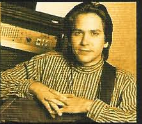
Mike Porcaro / Toto