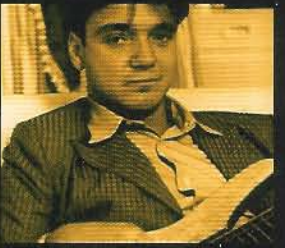
Guy Pratt / Pink Floyd