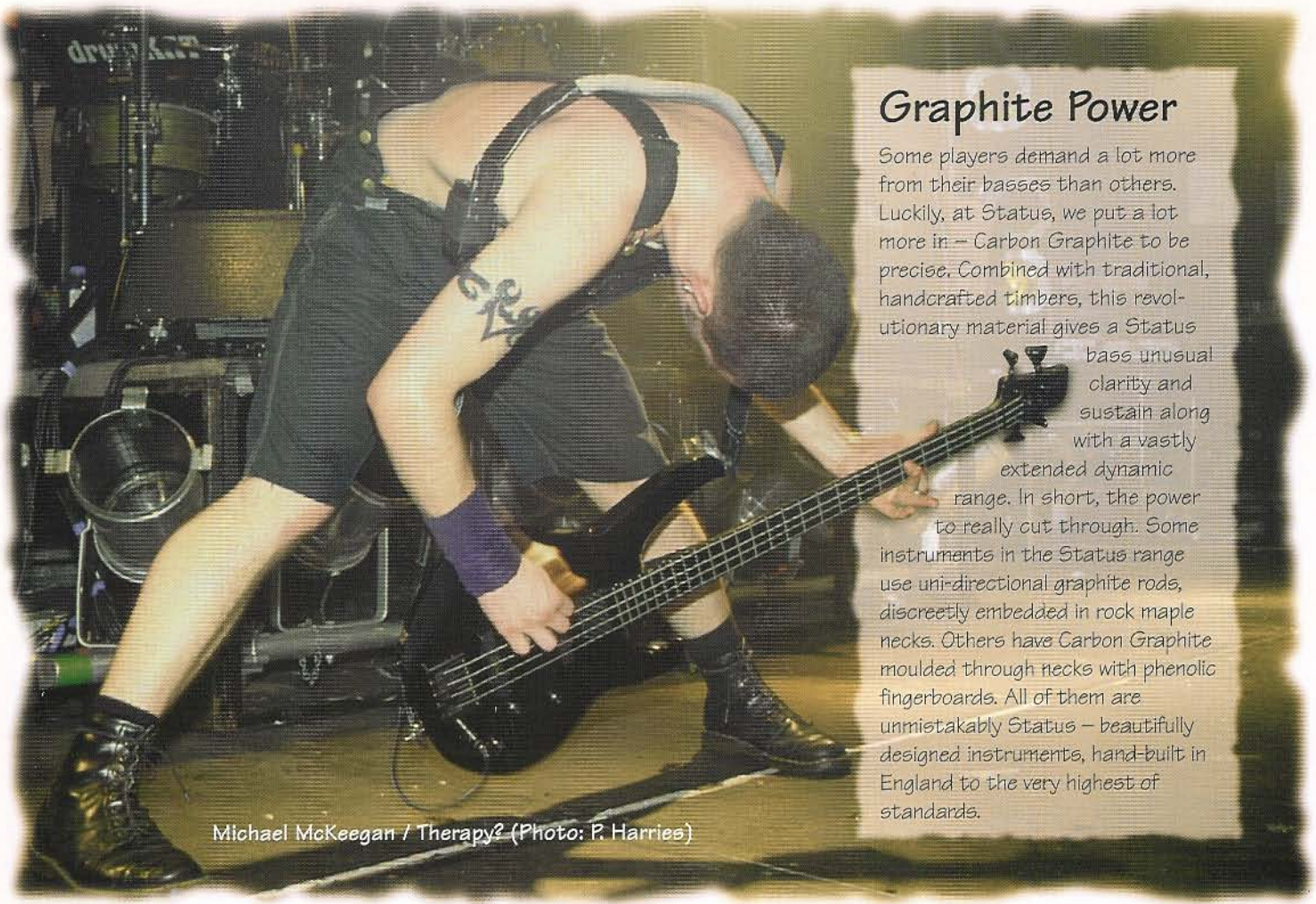
Michael McKeegan / Therapy?