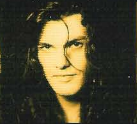
Markus Gfeller / Axis